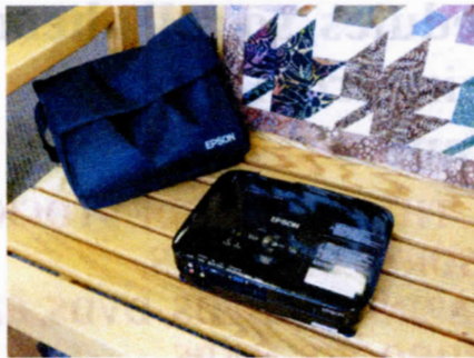
HP laptop and digital projector

Over the past twenty years the Friends of the Library has provided over $62,000 for tangible gifts to the Library and support for community programs. Many of these Friends' contributions were not advertised at large, but their impact on the operations of the Library and on the cultural life of the community have definitely been felt.